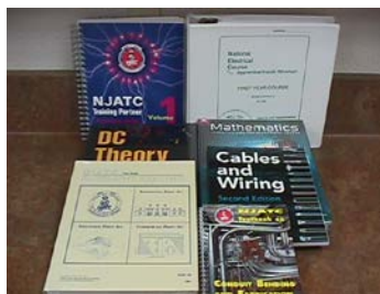
First Year's Books